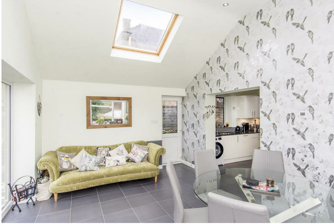
Family Room (Photo 2)