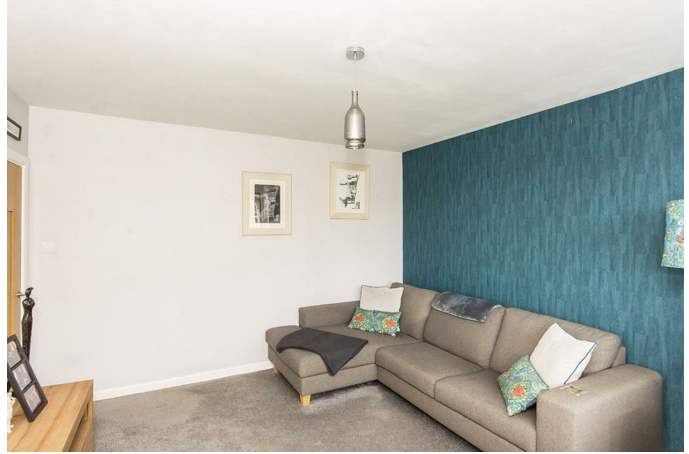
Lounge or Bedroom Three (Photo 2)